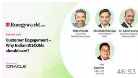
Fireside Chat with Utility Leaders | Customer Engagement – Why Indian DISCOMs should care